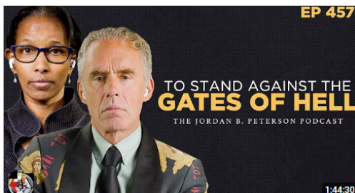
Ayaan Hirsi Ali joined Dr. Jordan B. Peterson on his podcast to discuss the subversion of the West and the importance of Christian ideals in today's world.