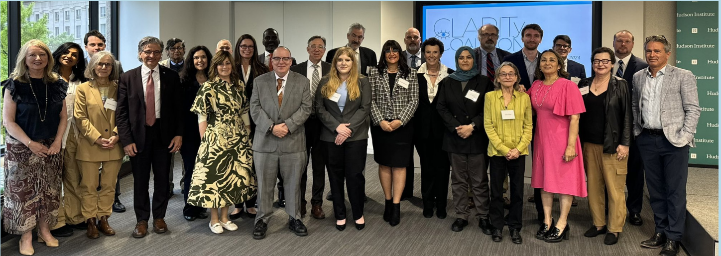
Group photo of participants at the 2024 CLARITY Coalition Conference in Washington, D.C.