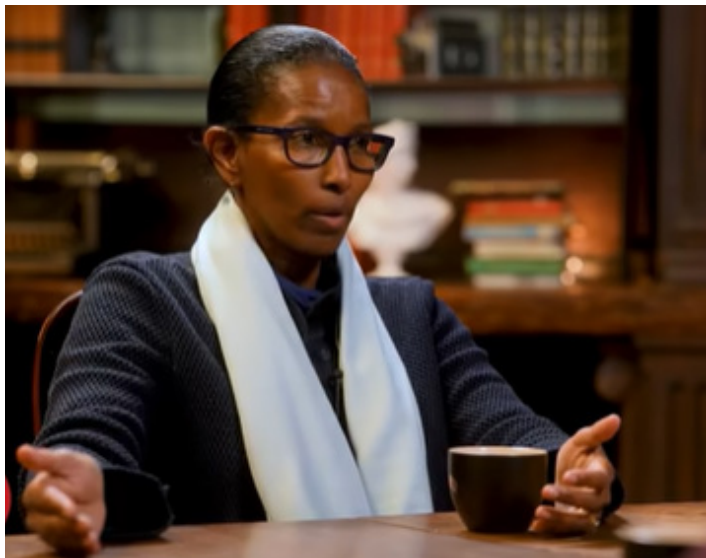
Ayaan Hirsi Ali on the Triggernometry podcast discussing her personal experiences and insights into the rise of radical Islam and its impact on Western values and security.