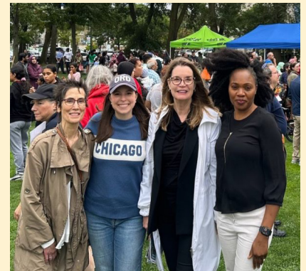
Members of our Chicago steering committee attended Law Enforcement National Night Out, where they connected with frontline service providers to raise awareness about FGM/C.

Our successfully completed "WE STOP FGM/C" program in Chicago's North Side has become a national blueprint for other cities to emulate. Through our model, we not only achieved the program's sustainability but also ensured its long-term impact by embedding prevention strategies into local organizations and fostering a lasting network of advocates.