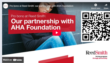
Watch on YouTube: a video about AHA's Partnership with Reed Smith