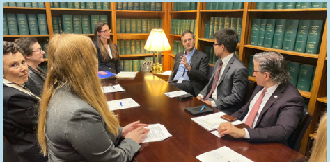
CLARITY Coalition members strategize ahead of meetings with legislators to rally support for the DETERRENT Act.